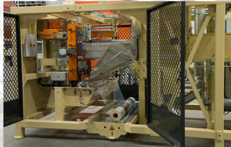
Packaging out of flat foil