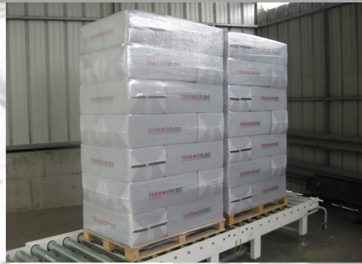
Cellulose bales on a pallet

10 up to 35 kg (depending on bulk density and compression ratio)